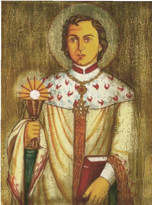
Icon of Saint Cloud

St. Cloud, born in 522, was the grandson of Clovis, founder of the Kingdom of the Franks, and St. Clothilde. Following the death of his parents, he and his two brothers were cared for by St. Clothilde, the widowed queen. Upon his father's death his uncles sought to seize his father's throne by plotting the murder of St. Cloud and his two brothers. They succeeded in killing his brothers, but St. Cloud escaped and sought sanctuary with St. Remigius, the Bishop of Rheims. St. Cloud grew from childhood into young manhood under the guidance and protection of the holy bishop and his sainted grandmother.