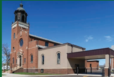
STS. PETER & PAUL