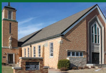
ST. FRANCIS DE SALES