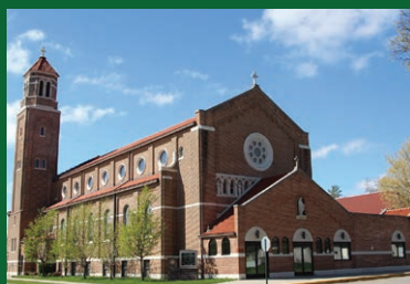
OUR LADY OF THE ANGELS