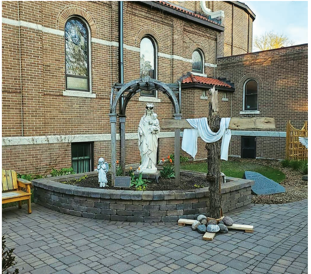
The Mary Garden at Our Lady of the Angels is a peaceful place where one can retreat with the Lord.