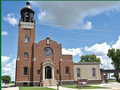
STS. PETER & PAUL