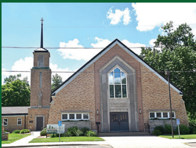
ST. FRANCIS DE SALES