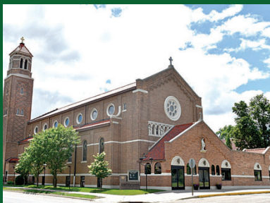
OUR LADY OF THE ANGELS