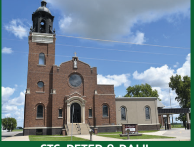
STS. PETER & PAUL