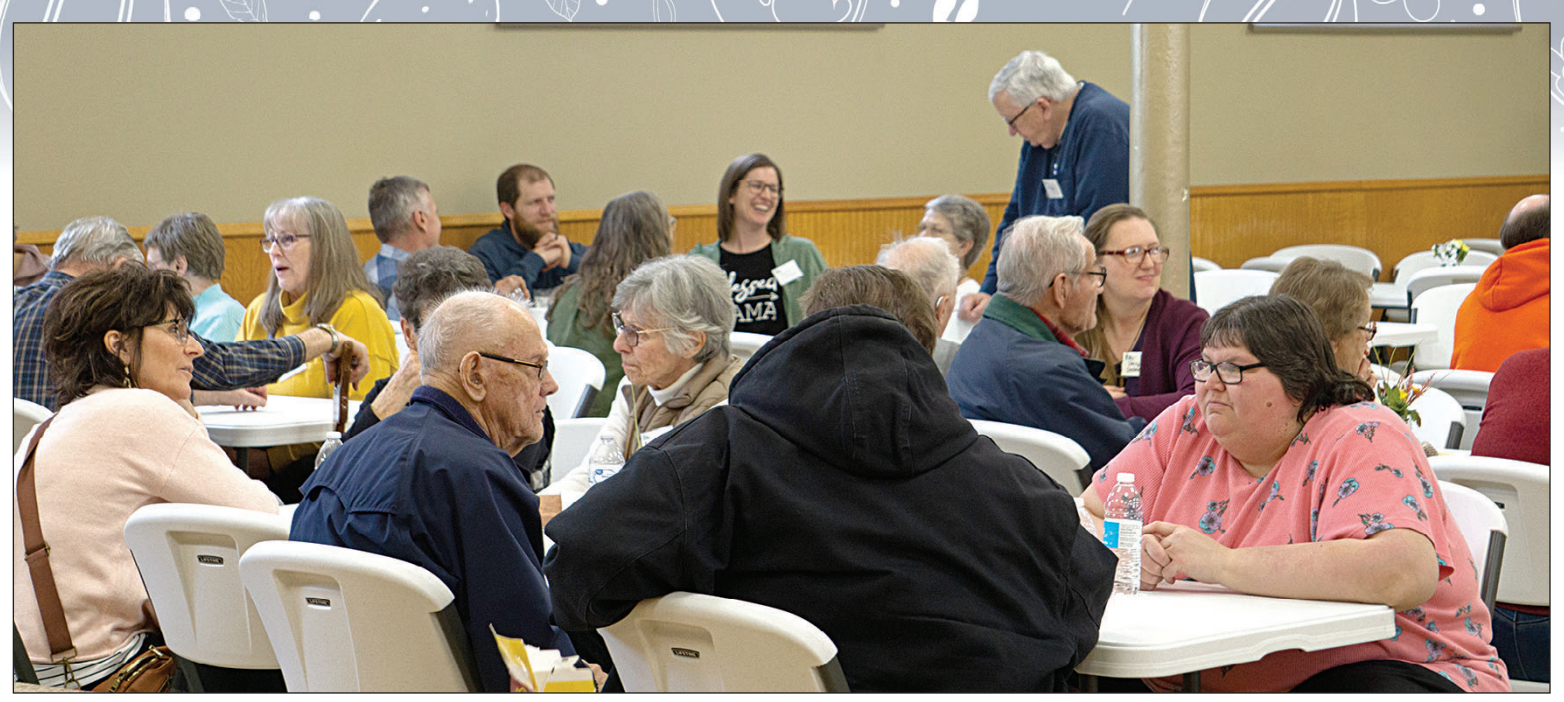
Retreat attendees converse over lunch.