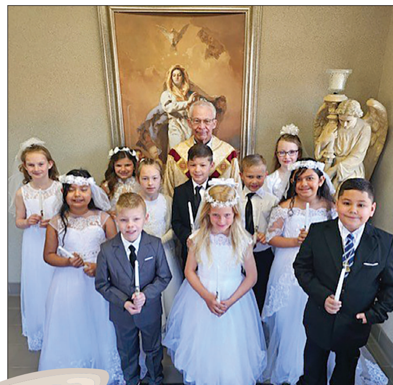
Our Lady of the Angels