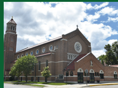
OUR LADY OF THE ANGELS