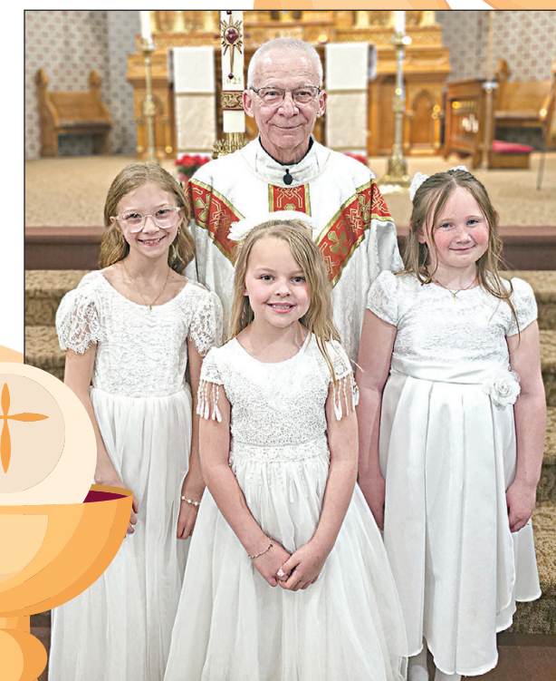
St. Paul's Church