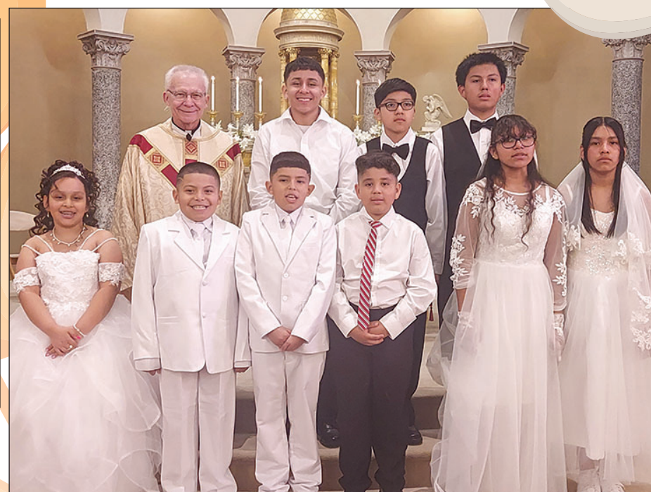
Our Lady of the Angels Church