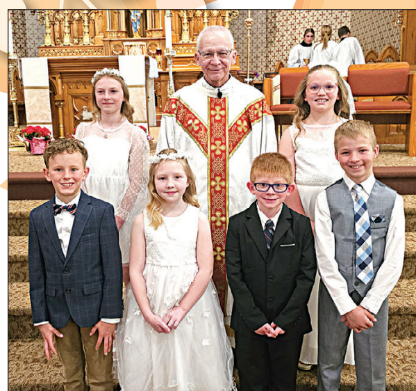
St. Paul's Church