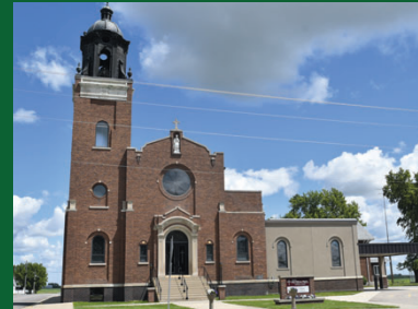
STS. PETER & PAUL