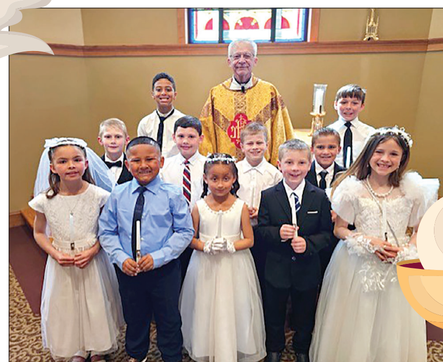
St. Paul's Church