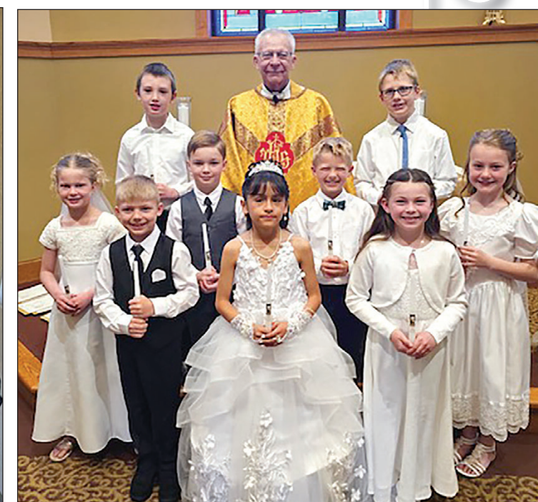
St. Paul's Church