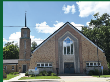
ST. FRANCIS DE SALES